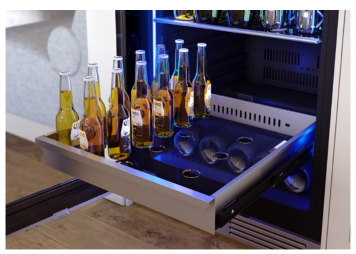
Full-Extension Stainless Steel Rollout Bin with Transparent-Gray Glass