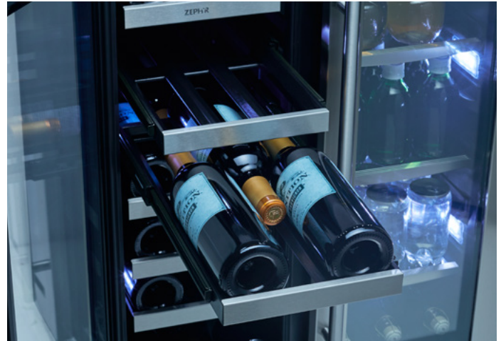
Full Extension Wood Racks