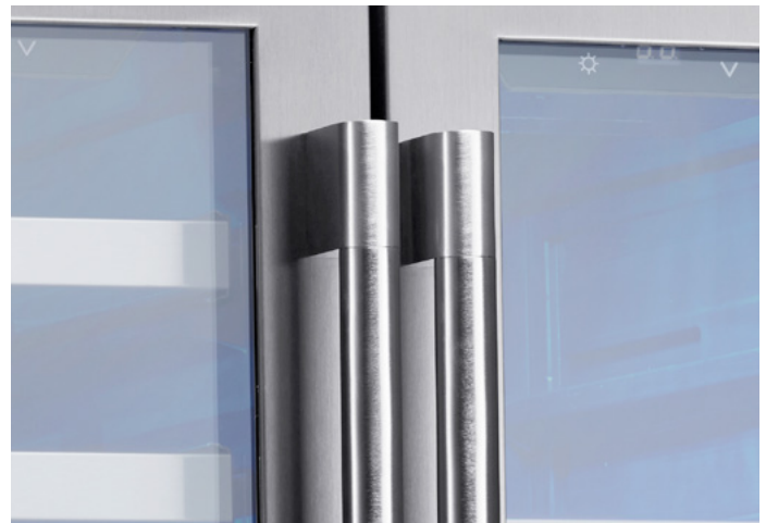
Optional Pro Handles