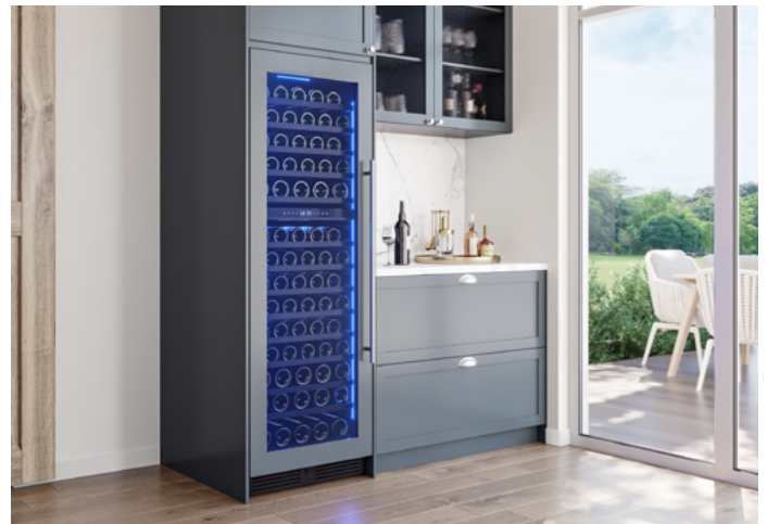
Accommodates custom wood overlay panels