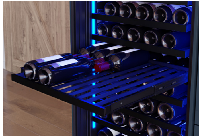
Full-Extension Wood Racks