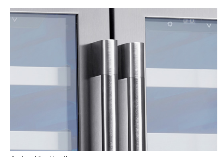
Optional Pro Handles