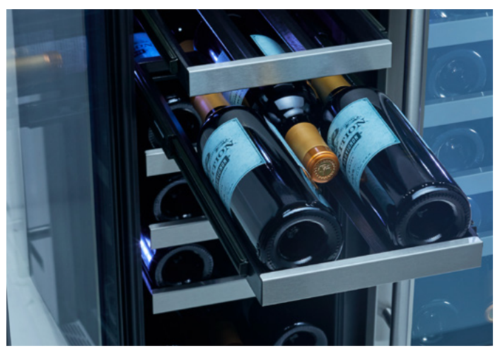
Full Extension Wood Racks