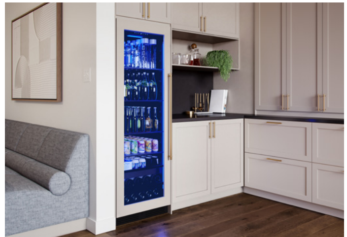
Accommodates custom wood overlay panels