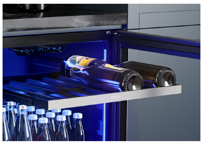
Full-Extension Wood Rack