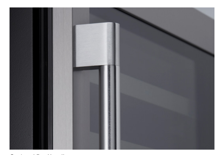
Optional Pro Handle