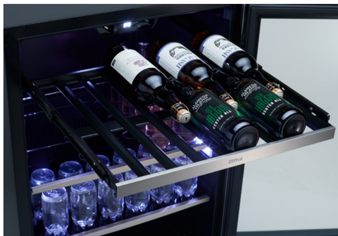
Full Extension Wood Rack