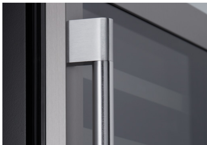
Optional Pro Handle