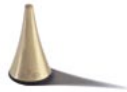
The ingenious conical remote control is more than a conversation piece—it puts you in charge of power and light from a distance.